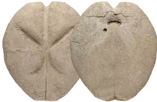
Predation on sea urchins during the Mesozoic Marine Revolution