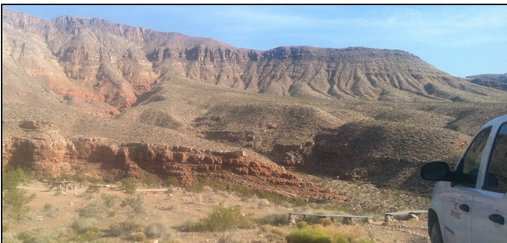
Paleoecology of recovery following the Permian-Triassic Mass Extinction