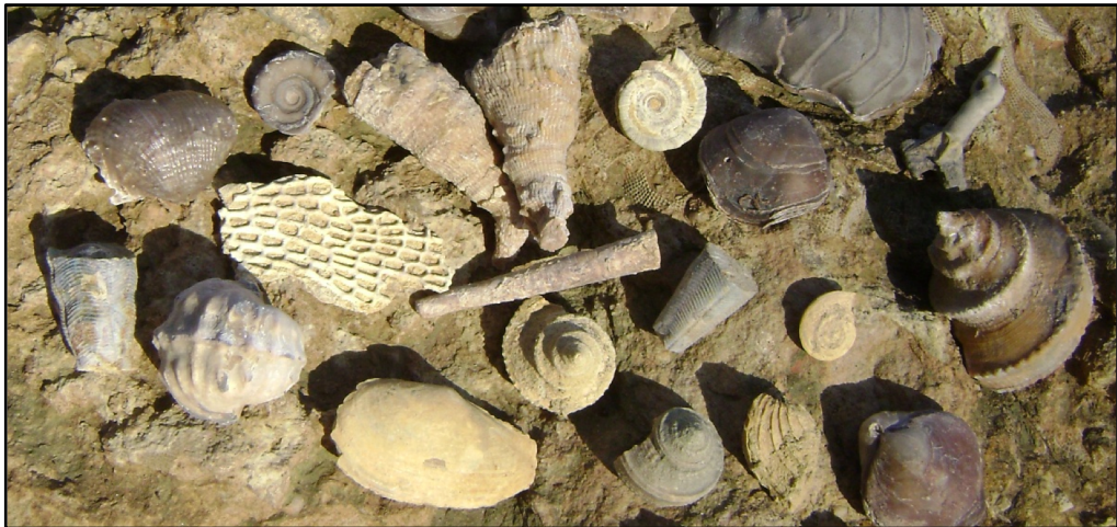
Structure of marine ecosystems during the Late Paleozoic Ice Age